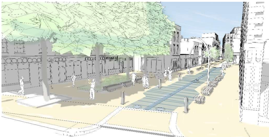
ii View of proposed Liffey Street Lower Plaza looking north.

A full set of the Pre-Part 8 Drawings is included to accompany this report for information.