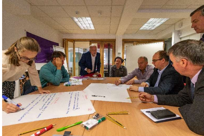
iii Photograph from Workshop 1 held on 6th September 2018

The next stage shall include the formal public consultation period following lodgement of the Part 8 application.