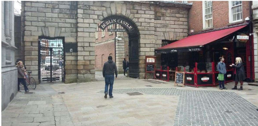
iv Material precedent for Leinster Granite at the pedestrian entrance to Dublin Castle.