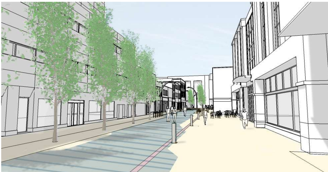
viii Sketch perspective of Liffey Street Upper looking north.