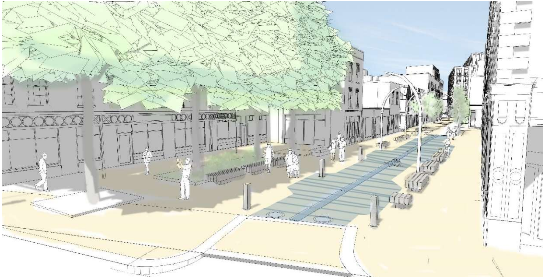
vii Sketch perspective of Liffey Street Lower Plaza looking north.