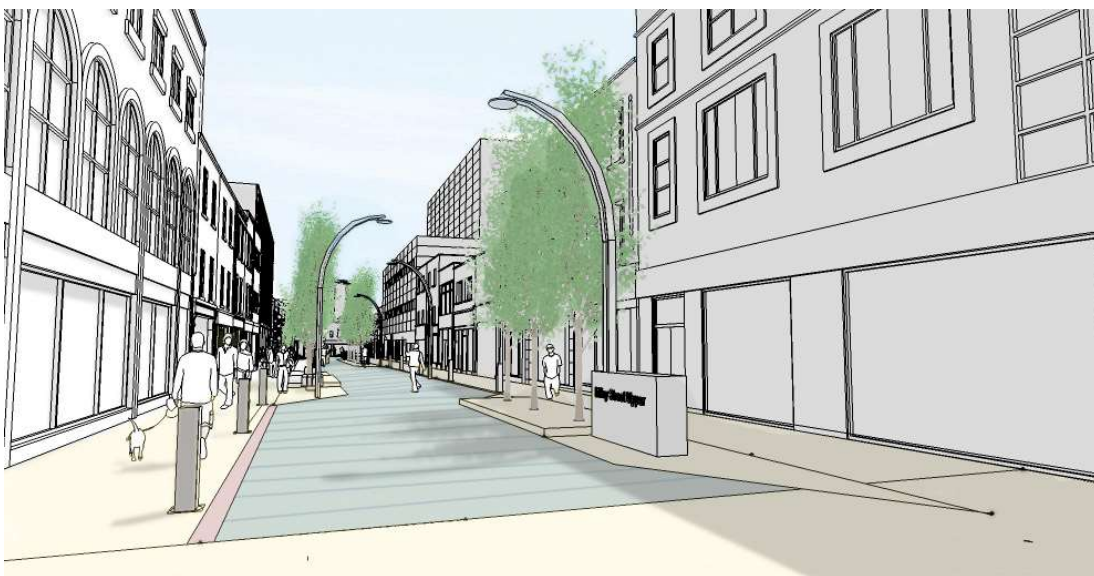
ix Sketch perspective of Liffey Street Upper from Henry Street looking south.