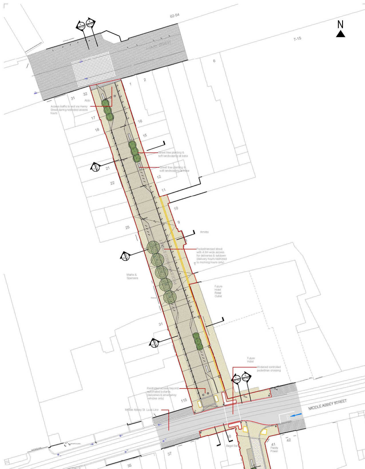
V Liffey Street Upper Proposed Site Plan. See draft planning drawing dPL-108.